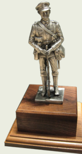
Regimental Certificate in diploma cover and 6 1/2 inch pewter statue with engraved nameplate