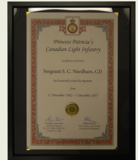
Regimental Certificate in frame and 6 1/2 inch pewter statue with engraved nameplate