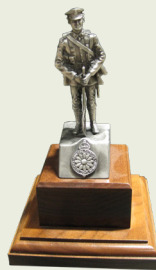
Regimental Certificate in diploma cover and 4 1/2 inch pewter statue with engraved nameplate