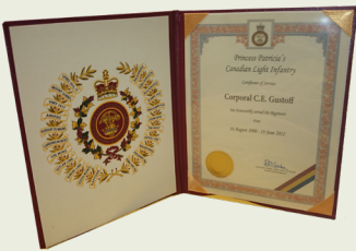
Regimental Certificate in diploma cover